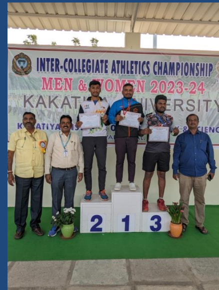
ICT-KU Athletic Championship 2023-24 Goldmedal in Hammer Throw event